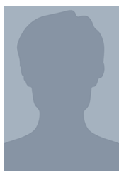
Lara Milevoj Kopcinovic 1,2