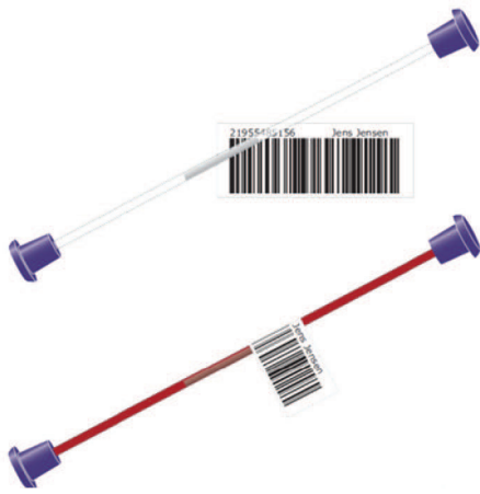
Figure 2. Recommended capillary blood gas sample labelling

In order to ensure arterial sample quality and result reliability, laboratory personnel should inform ward personnel responsible for arterial blood collection of the required procedures.